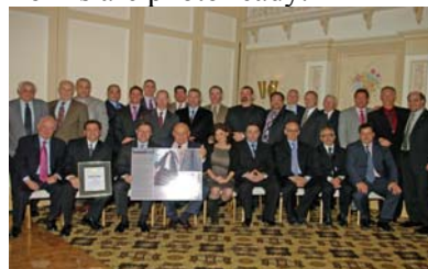
The Annual Award Winning Team portrait.